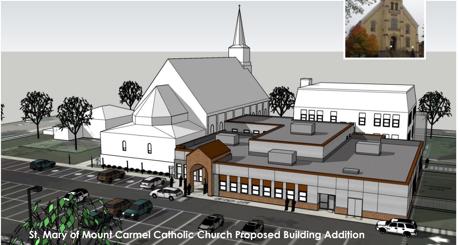
St. Mary of Mount Carmel Catholic Church Proposed Building Addition