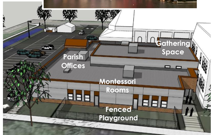
Montessori Rooms - East Entry