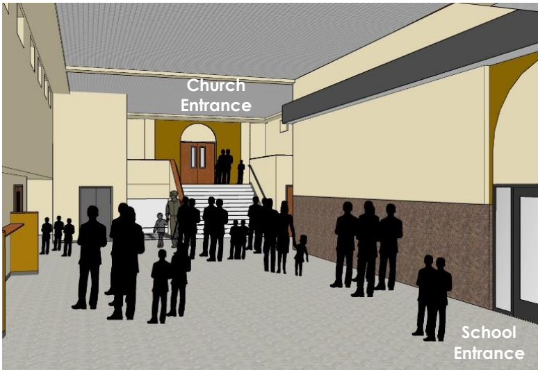
Gathering Space - Church and School Entrances